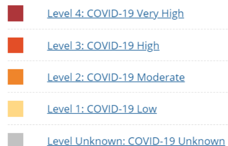
Risk Assessment Level for COVID-19

CDC Risk Assessment Level for COVID-19 (as of 3/11/2021)